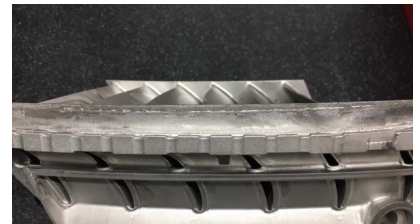
Outer Platform Wall Repaired