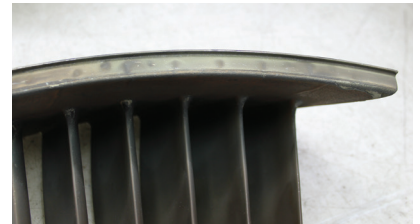
Outer Forward Lip

Chromalloy is continuously developing new FAA-approved technologies and repair solutions for engines. LifeX includes custom parts, repairs, engine management, and serviceable materials that reduce the total cost of ownership of gas turbine engines. We partner closely with customers to understand immediate and long-term needs, and create unique, custom solutions to reduce engine down time, lower costs, and increase engine life.